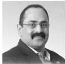
Author: Rajeev Chandrasekhar – Member of Parliament

Log onto: www.rajeev.in Email: rajeev.c@nic.in